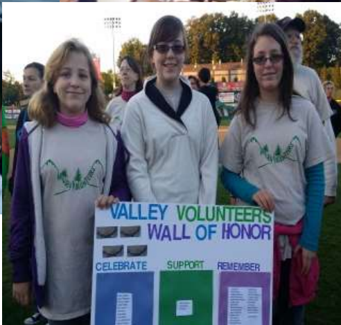
← Relay for Life (Hermann Girls)