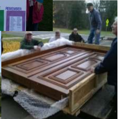
↑ Unloading New Doors for Church

As we look ahead to the feast of giving thanks, here are some of the fruits of our labors for which we are most grateful: