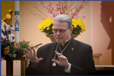
Bishop Scharfenberger 1 Minute Video Footage HD 1080 - No Audio DOWNLOAD .MP4