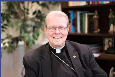
Bishop Scharfenberger Headshot # 1 5618x3933 DOWNLOAD .JPG